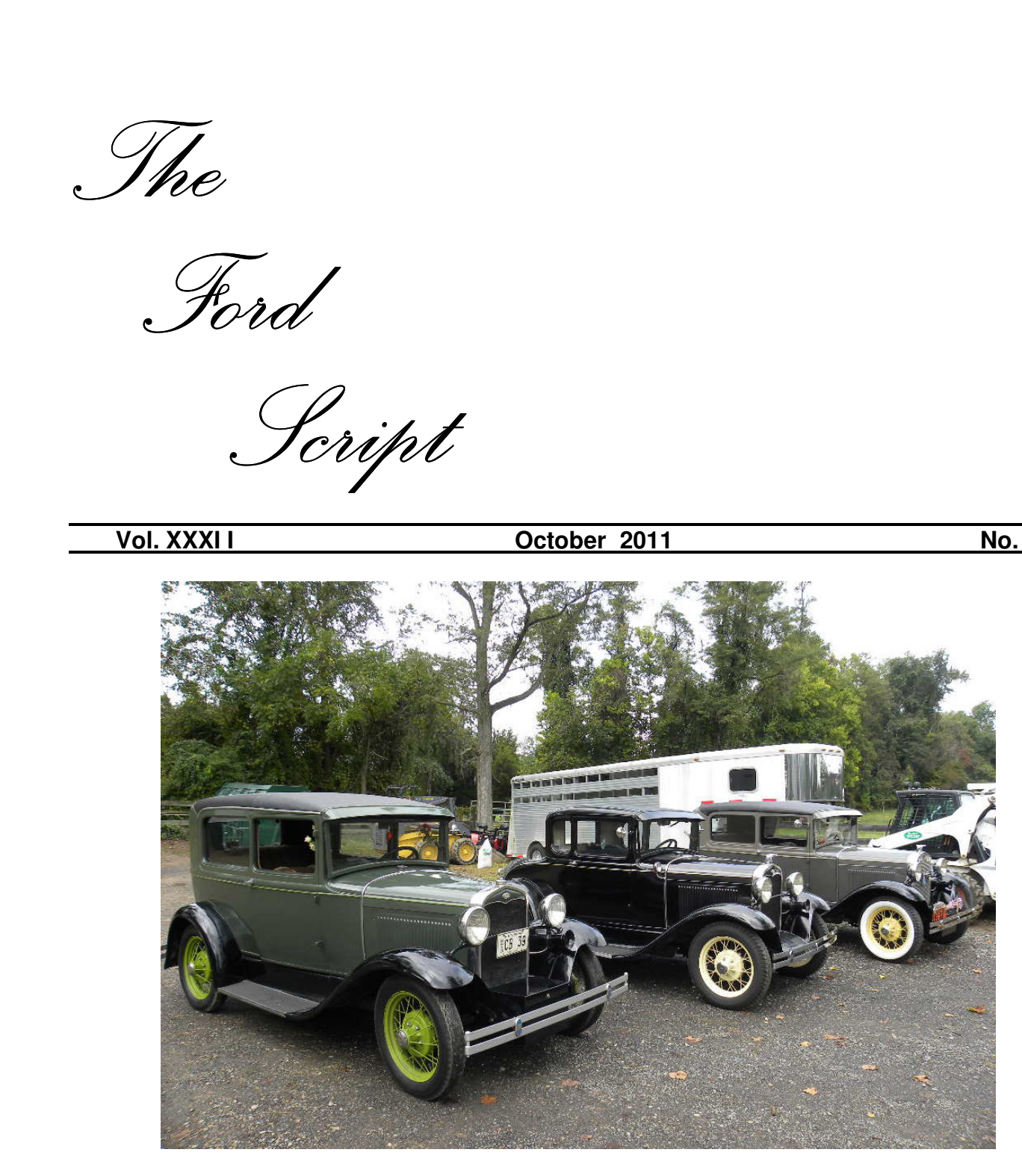
3 Who Braved the Weather at the Chickin' Pickin'