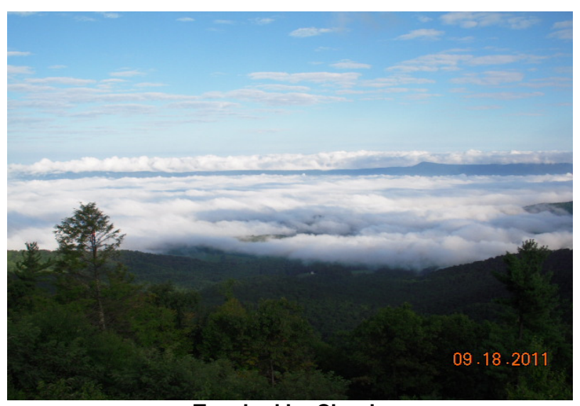
Touched by Clouds

The weather was chilly with a light rain, but it didn't dampen our fun, or lessen our appetites. The staff made 5 kettles of apple butter, three of which sold out on Saturday. The pints and quarts canned from the remaining two kettles were available on Sunday morning in the gift shop.