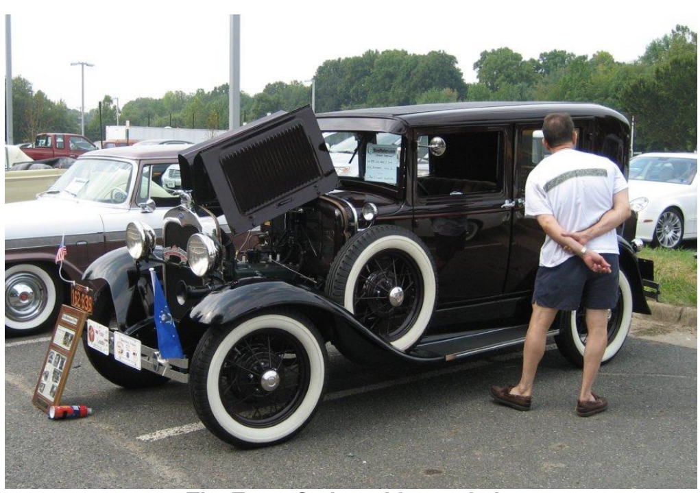
The Town Sedan with an admirer