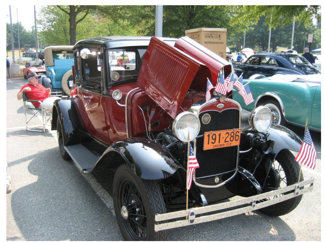
Jim Gray lounging behind Ruby