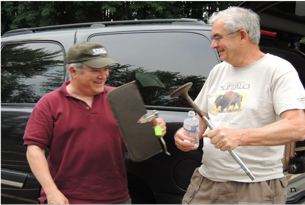
GWC members discuss risks of using non-OEM parts in a Model A, at the GWC Flea Market