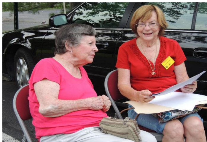
Baby pictures at a flea market? Why not?