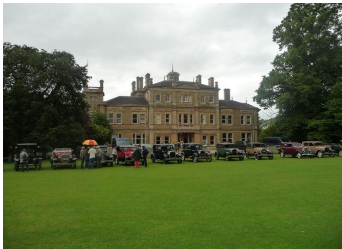
Bruern Abbey School, Chesterton House, Chesterton, Oxfordshire

I followed the Tudor through the gates which opened up to a glorious sight. Before me lay a stately sandstone mansion, surrounded by cars lined up on the expansive, manicured lawn. It was a gorgeous edifice, a school that was simply awe-inspiring. Even though I was early, I was offered a glass of wine as a precursor to activities. I knew this gathering had its priorities right! We colonials could take a lesson or two on this practice! Enough of that - now to the cars.