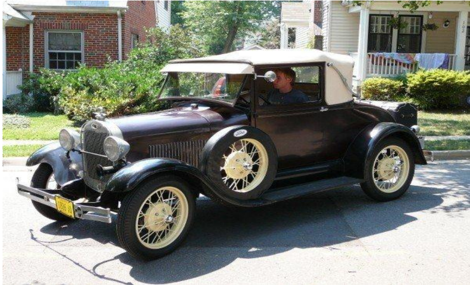
For Sale: 1929 Model A Sport Coupe

This Sport Coupe is in fair condition and needs some restoration. Much of its mechanical work has been done. It has a new radiator, six volt alternator, leakless water pump, high compression head, modern points and condenser, four cast iron brake drums (three are installed). The