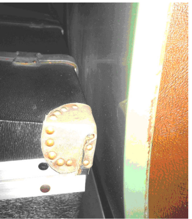
Trunk too big for the rack? Then turn the rack over!

Turns out the owner had a very nice huge trunk that didn't fit inside the rack. He turned the trunk rack upside down and the trunk fit perfectly – you could even open the rumble seat. What a stunningly smart idea. Previously, I sold a trunk I really liked as it was a squinch too wide. I wished I had known of this idea then.