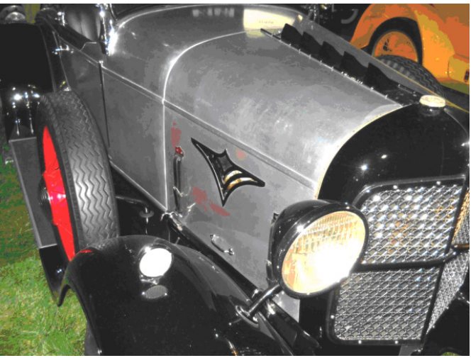
Favorite car on the lot: The unique cast aluminum Model A roadster for $71K.