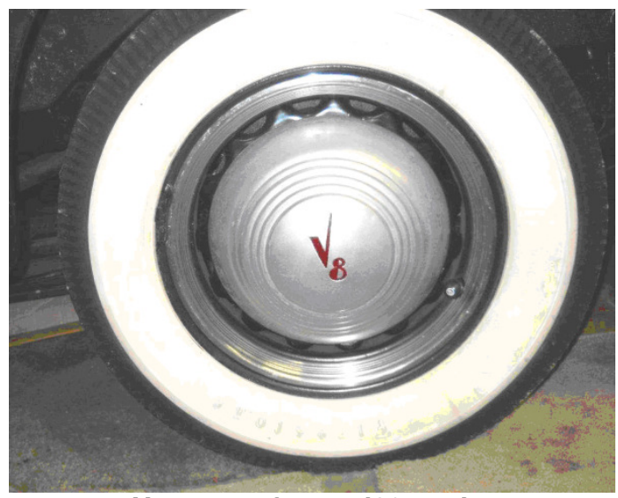
Who Done It?