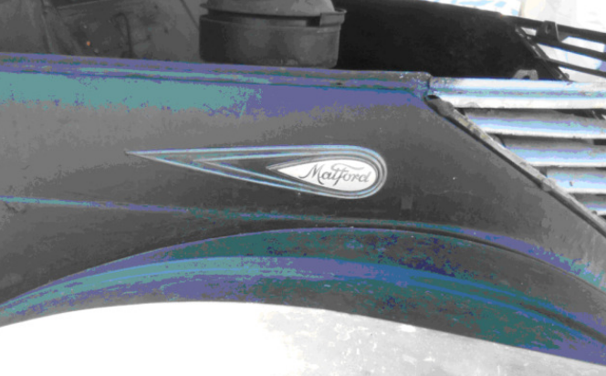
Best Lost Marque car: the Matford... it could be yours for $137K

Fav part: the greatest part of Hershey is exchanging stories and fun late at night amongst the junk over hot chocolate on the hallowed fields of Hershey. On this Wednesday night sortie, Jim and I discovered two wonderful treasures: a work of art in a cast aluminum Model A, and a work of ingenious adaptation in making a too-big trunk fit on a Model A trunk rack.