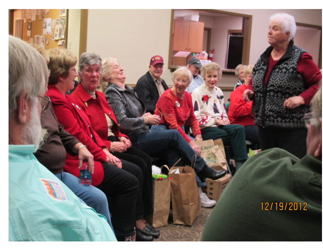
The first prize about to be lost