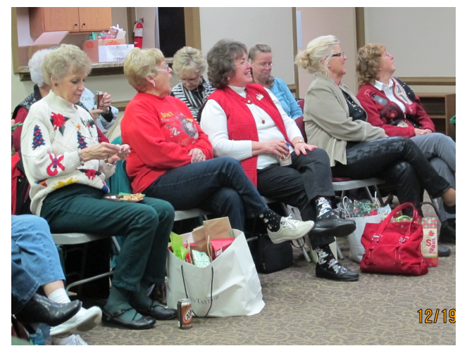
The GWC brown bag Greek Chorus