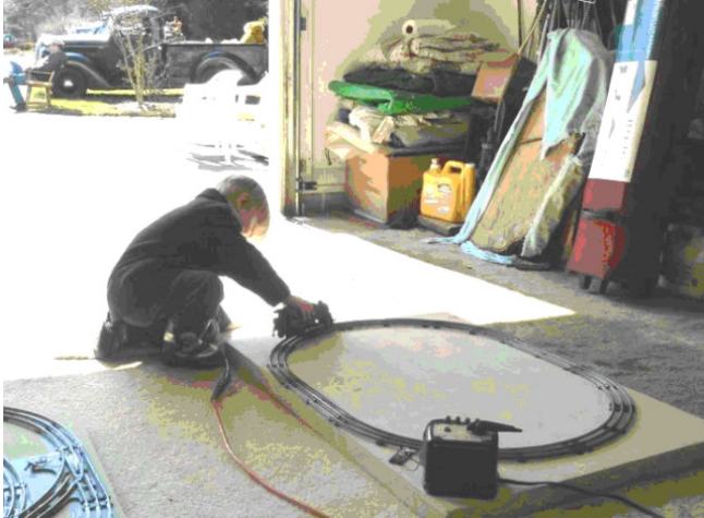
Old Cars; toy trains; kids... Check!