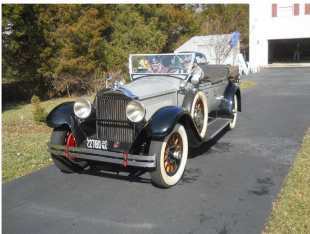
Takin' Clem's "Gray Lady" out for a spin