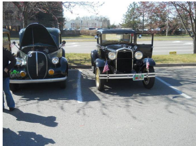
Uncle Raeman and Honey Bun