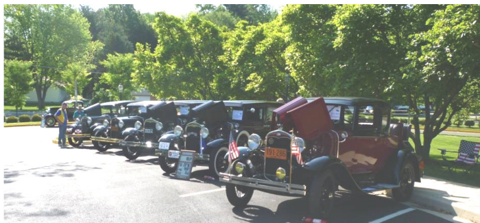
Our Model As at the 2012 Fairfax Show

The Northern Virginia Regional Group of the early Ford V-8 Club of America (and you thought OUR name was a mouthful) is presenting their annual show on Saturday, May 18 in front of the City Hall at 10455 Armstrong Street. Pre-registration deadline is May 12; the cost is $10 in advance or $15 at the gate. If you want to go, send a check made out to "Northern Virginia Regional Group EFV-8" to: