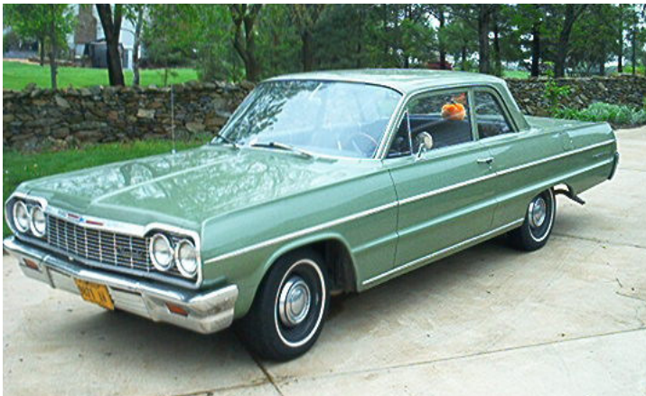
The Green Pumpkin