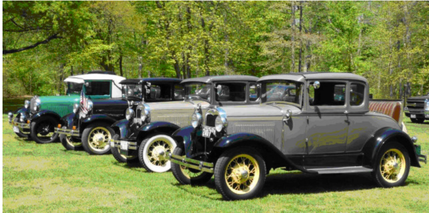
Four of the six Model As at the beautiful Merkel Farm

Saturday, April 27, brought nearly 60 of us together at Janet Merkel's farm in Bowie, MD, to work on some small parts and socialize in near-perfect weather, with dry air, a slight breeze, and temperatures in the high 60s.