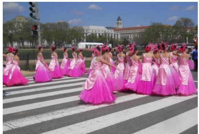
Parade Princesses

The parade herders got us all lined up and primed for... parade time!