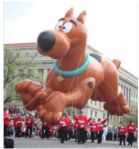
Scooby Doo