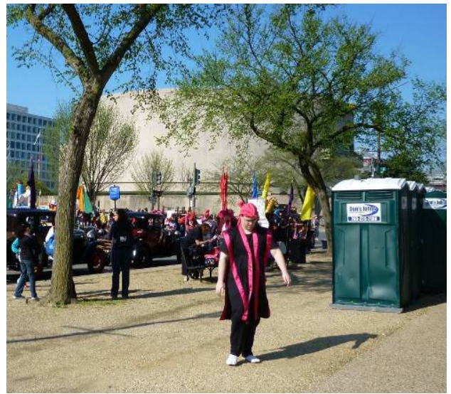
Everyone knew where we were.

... and saw that they had put us right next to the portable necessities. And here we thought everyone was coming in our direction to see our cars. Maybe they had other callings.