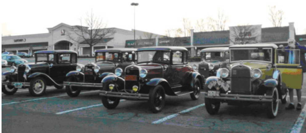
Pam Am Shopping Center. 7:00 a.m.

I think I hear the same general questions each time I stop somewhere when driving Ruby: “Is there a car show today? Are you going to a parade?” On Saturday April 13, when the young man asked me those same questions at the Pan Am Shopping Center in Fairfax, I told him, “Yes... we’re going to the National Cherry Blossom Parade.”