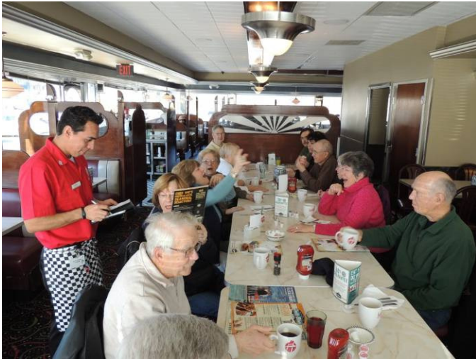
Good food & good coffee

The second Caffeine Double Clutch was held at the Fair Lakes Silver Diner on Tuesday, April 2, at 9 a.m. Seventeen folks from the GWC and the Northern Virginia Regional Group of the Early Ford V-8 Club (EFV-8) enjoyed 2 hours of breakfasting and talking. The conversations ranged from cars to grandkids to wildlife to Clem's recent fantastical Sugar Loaf AACA Westminster flea market finds.