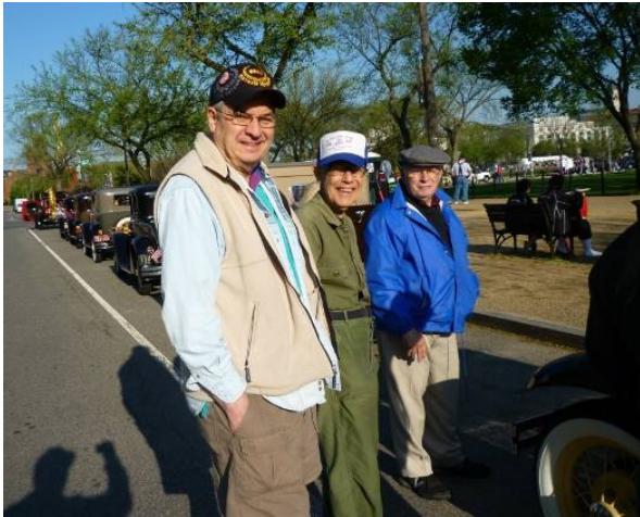
We're ready!