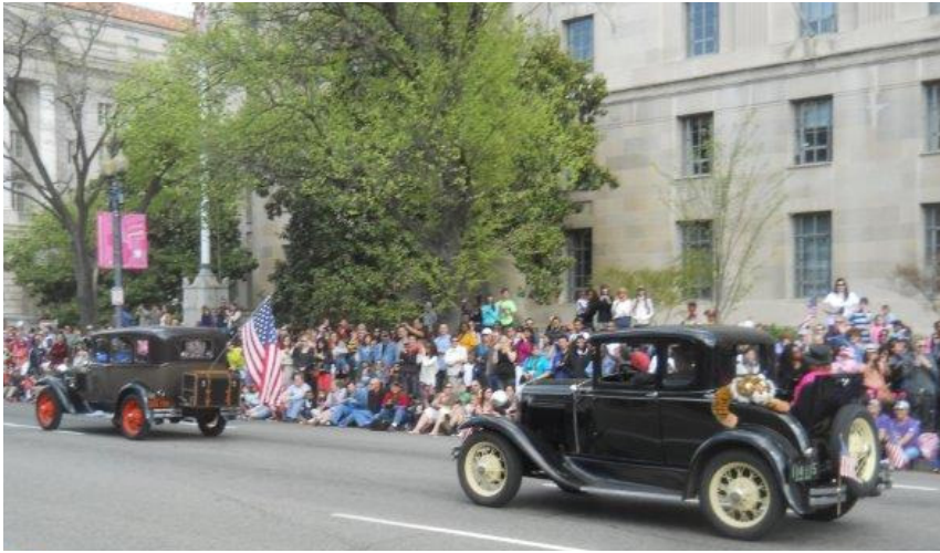
Constitution Avenue Crowds