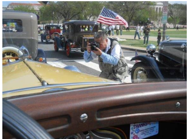
... and looking good!

The weather was perfect... not too warm or too cold, with just enough breeze to put snap in our flags.