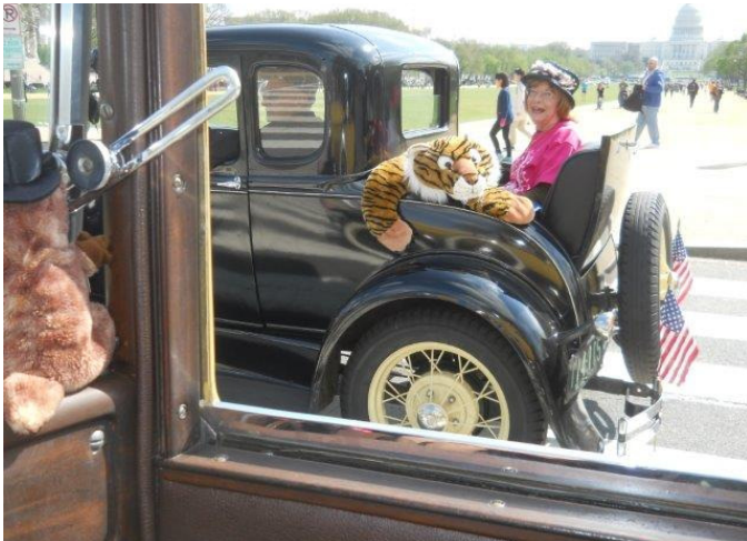
Ready to roll!

The weather was perfect... not too warm or too cold, with just enough breeze to put snap in our flags.