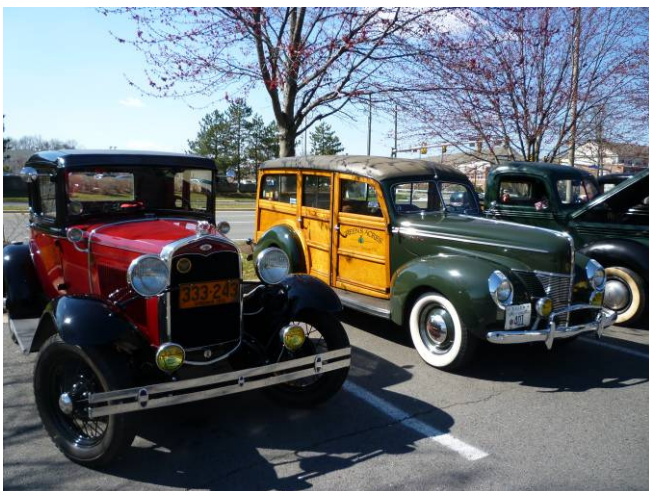
On display