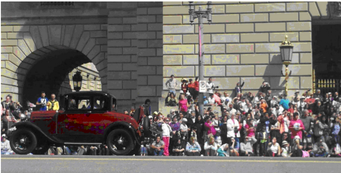
Parading for the crowds along Constitution Avenue

All along Constitution Avenue, there were lots of cheering, waving spectators – it was as crowded as I've ever seen it. Every time we stopped A-hoogah-ing, someone in the crowd would pump his arm for more.