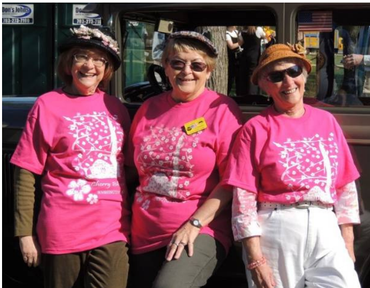
“Three little maids, from school...”

... and saw that they had put us right next to the portable necessities. And here we thought everyone was coming in our direction to see our cars. Maybe they had other callings.