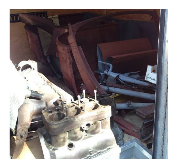
The heavy metal. We lifted 2 engines into the trailer...