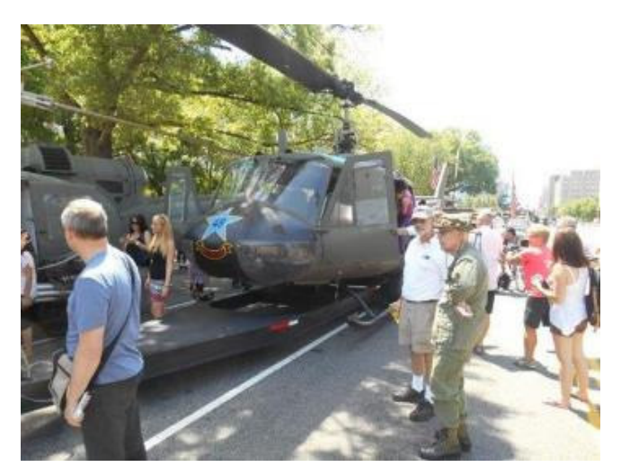
Sky Pilot Jim Warrenton pre flights a Huey