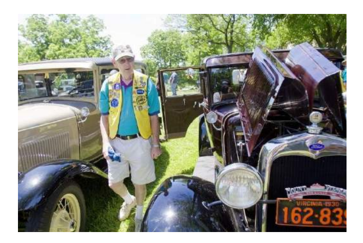
Note the special bandanna