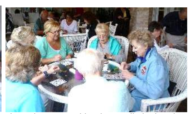
These Bingo ladies were SERIOUS; more prizes kept the competition hot until closing time.