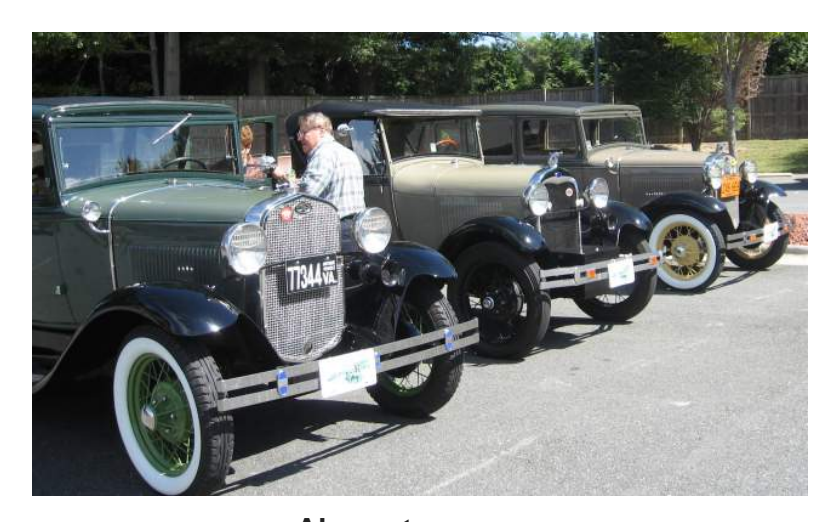
A's on tour