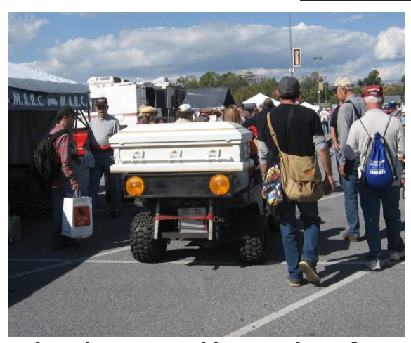
Ice chest or tool box perhaps?