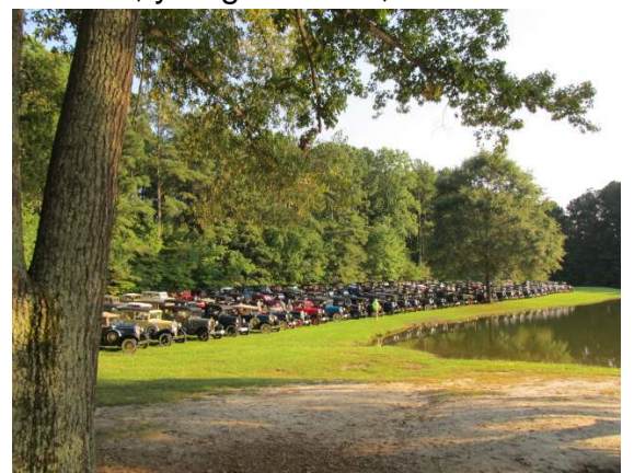
Welcome Party at Montague Lake

back to, you guessed it, The North Carolina Ale House. The food was still great and we had