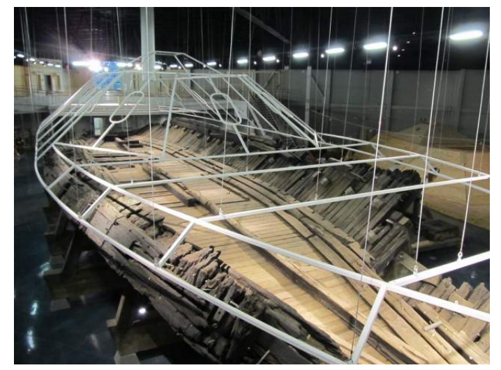
Confederate States Ship Neuse

and remained there as a floating fortification. In 1865, with Union troops advancing upriver