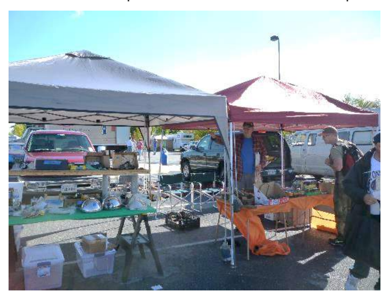
good price, but the buyer was a happy with what parts he wanted. So this year's Hershey trip was to sell Model A parts and give free advice. This was after offering these many parts to the GWC.