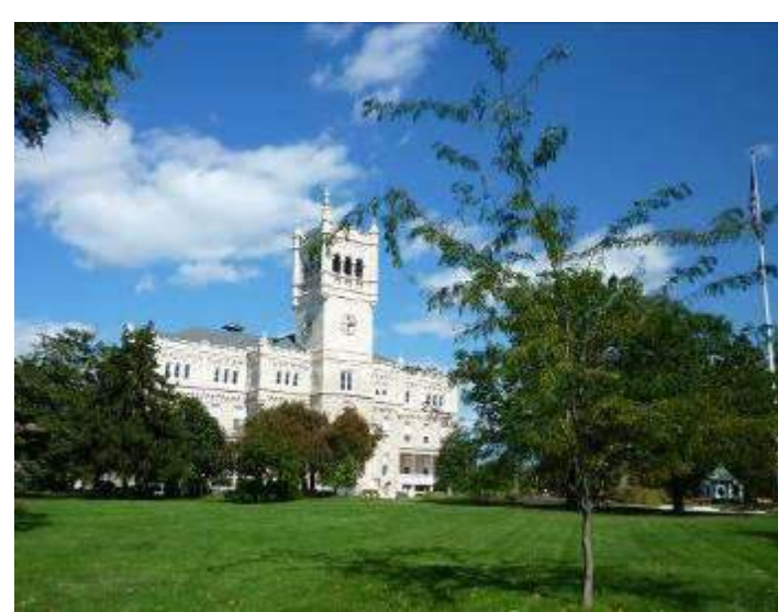
The sun was blinding on the way in, but that led us to beautiful weather once we arrived