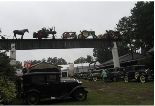
The history of farming lined up on an arch At the Eder family's 100+ Years of Progress collection