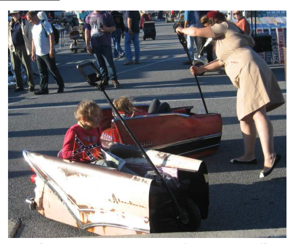
Kids' wagons made from '50s fins