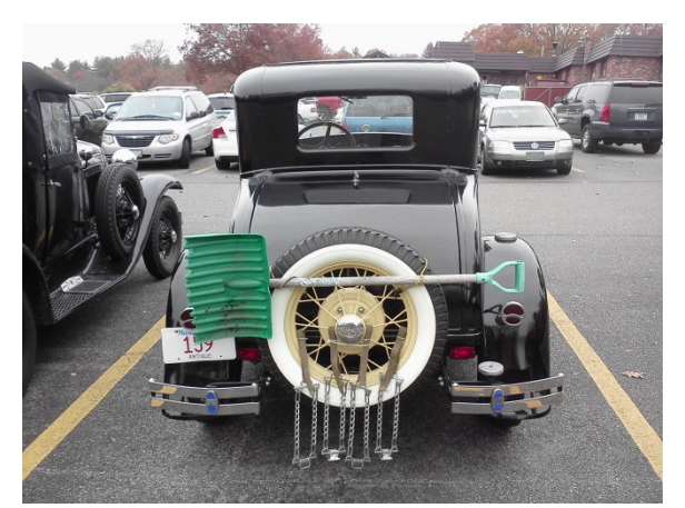
John Pierce - ready for the worst

I can understand why the Minuteman Club offers so many tours. The non-major roads are eminently drivable at an average speed of less than 45 MPH. In fact, many members were proud of their tour schedule (see p. 14) with more than 50 tours a year (something that should inspire us all). New England also offers some wonderful countryside, but, so can Virginia!