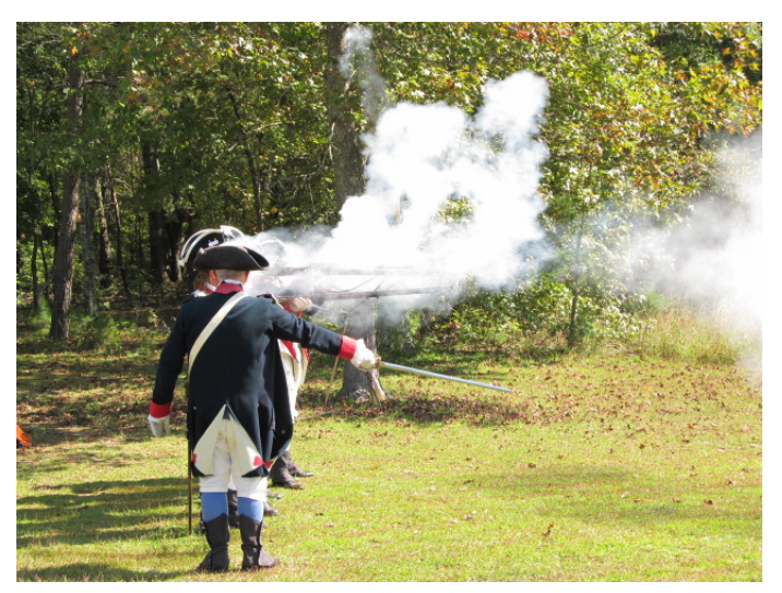
After the first shot you can't see a thing.

Again the Visitor Center and the museum had a great deal of information about the battle and, once again, an excellent movie explaining the two sides' movements up to and including the battle. There was a meandering walking path through the park that I enjoyed, without Scouts this time, and I got back to the center just in time to see a firing demonstration of muskets and a small cannon put on by some Continental reenactors. One thing I found very interesting was a presentation concerning the difference between the muskets used by both sides and the rifles used by the militia. The rifles were, of course, rifled and were very accurate. Muskets were not accurate until you were at close range but muskets were very sturdy and could be used as a club. A frontier rifle stock was much more slender and would easily break if used as club. Additionally, the muskets would mount a bayonet while the only bayonet a rifle could use was a plug bayonet, which "plugged" into the barrel negating its firepower. For these reasons both armies used the musket as their weapon of choice. Thus endeth the history lesson.