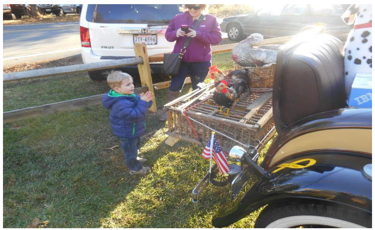
A little boy claps his hands to make the chickens on the back of Clem's Cabriolet squawk at Fairfax Station last month