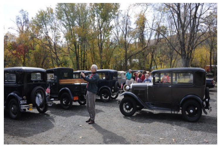
Bluemont, where there's no there there