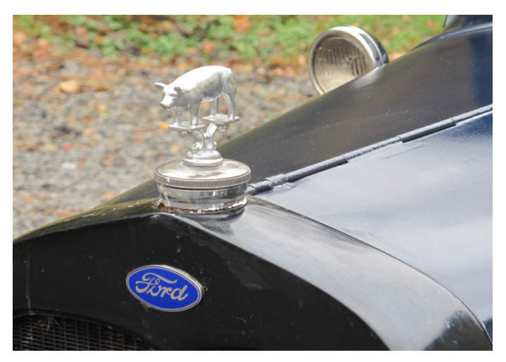
Yep, it's a pig.