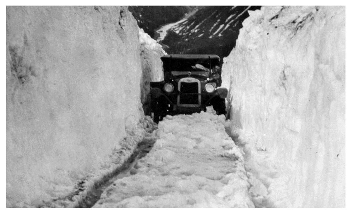
A quick run to the store for milk after the Blizzard of 2016