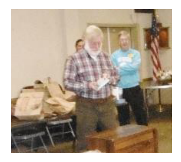
Our own Bird(house) man of Leesburg ponders his find.