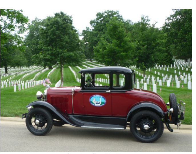
And a final tribute