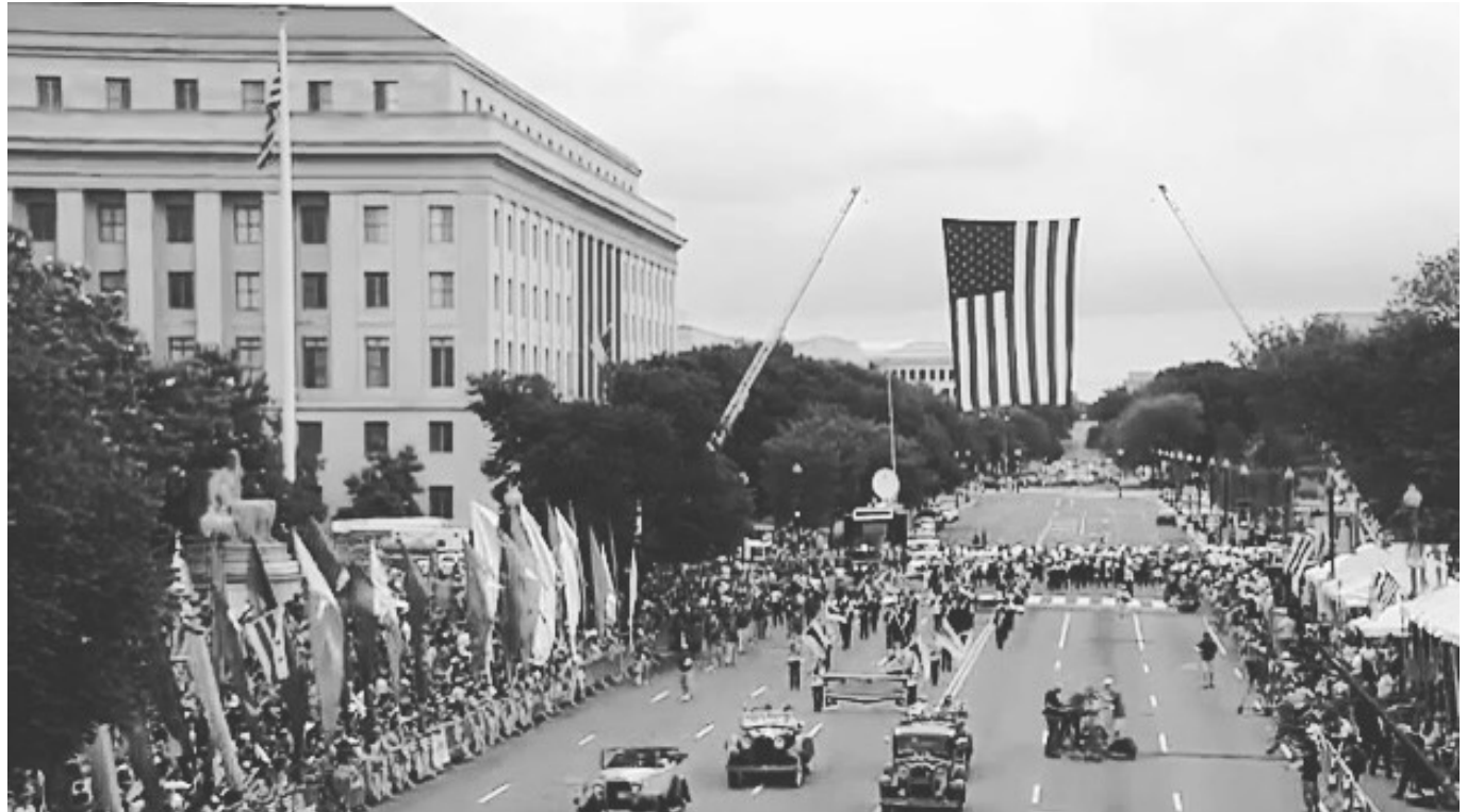
A's on parade on Memorial Day having passed under Old Glory