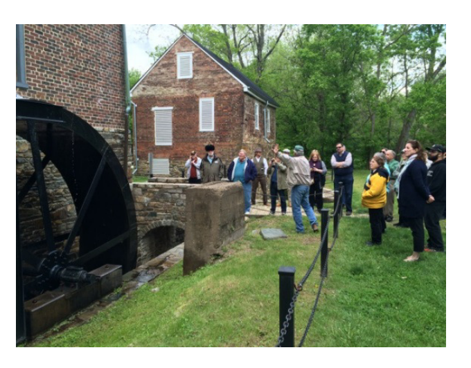
Last stop: the Aldie Mill