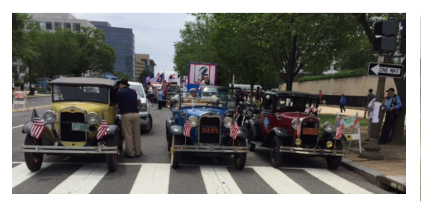
Waiting in the assembly area.