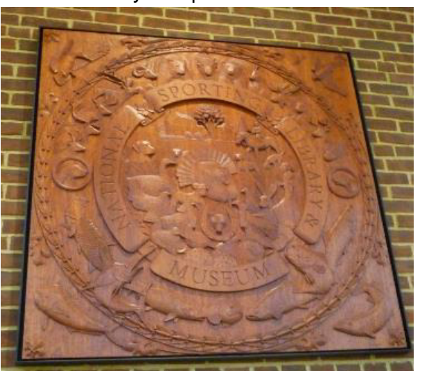
The artwork inside was wonderful, and at least one piece spoke volumes about our tour.