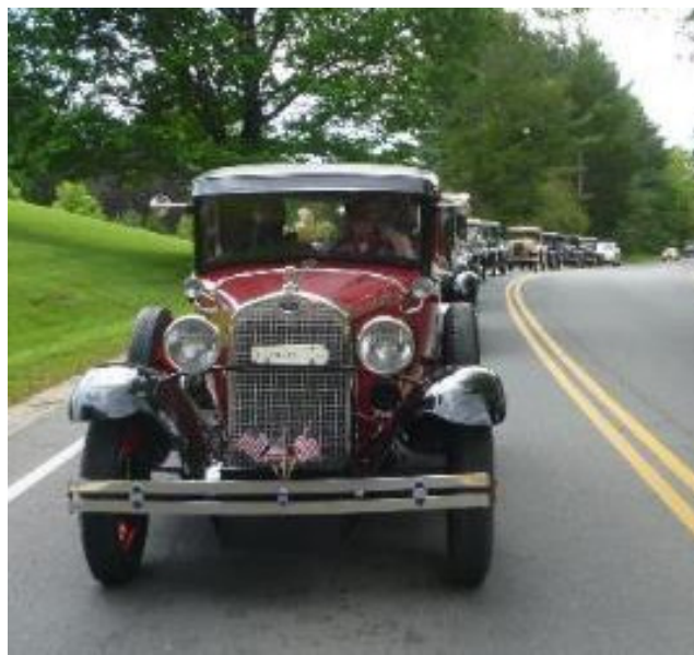
Following our time in and around Middleburg, we stopped at the Aldie Mill; another great history stop.