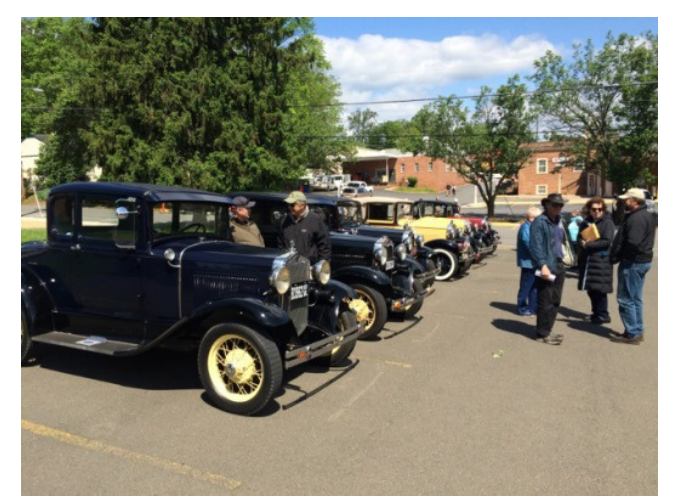
Morning gathering outside the Bob Evans