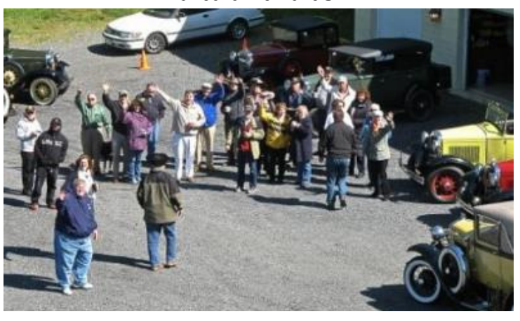
The group waves to a roof-top photographer. >>>>> June 2016