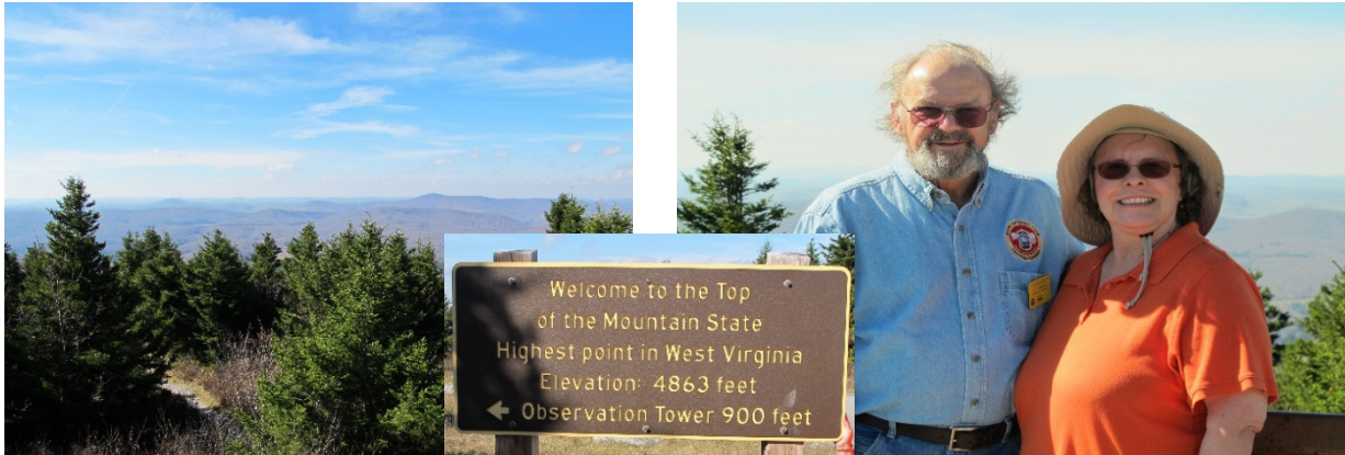
The view from the top of Spruce Knob. Someone needs a haircut!

from the tower at the top of the hill were fantastic. After Spruce Knob we headed back to the restaurant to regroup. On the way down, Carol and I were on our own and about half way down we