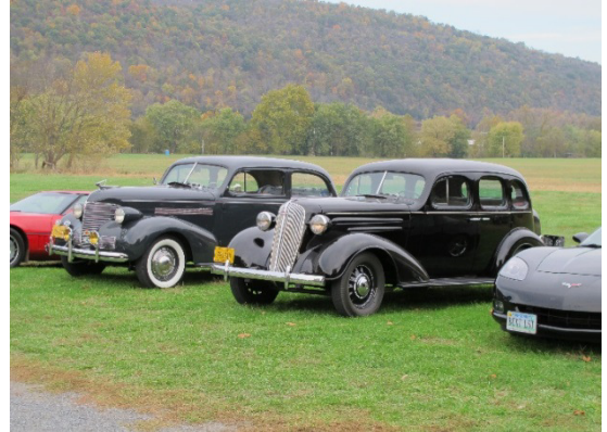
'39 Master Deluxe and '36 Sport Sedans.

Franklin served us a lunch of sandwiches, potato and macaroni salad, and chips he had picked up from a local deli. It was great and undoubtedly cheaper than food supplied on the train. And we got too many cookies for desert. As we arrived back in Romney, the rain that had been forecast finally made a showing and we got a bit wet getting to our respective cars. Still, it was a very enjoyable weekend and all