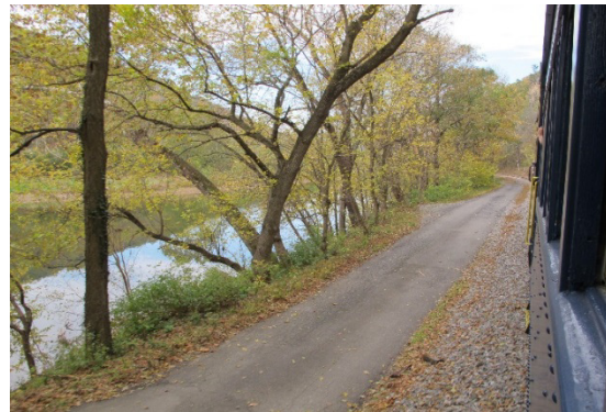
Going through the Trough.