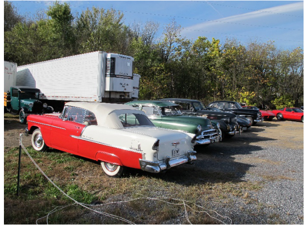
Some of the tour cars. The '55 is my favorite.