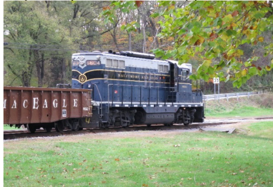
Our Engines. the one on the right was lead.

those Chevy folks were very tolerant of our nonstandard car. Turns out several had Model "A's" of their own, or had at one time owned one. They were a great group to be on tour with!