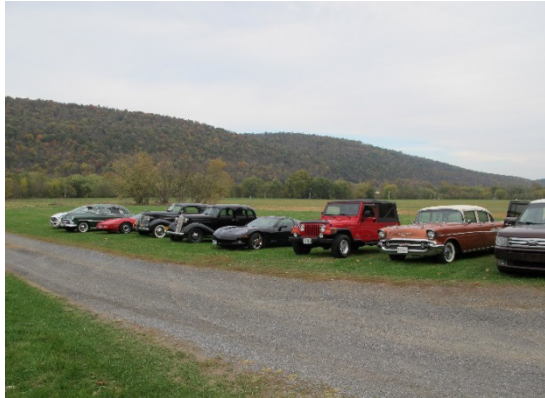
Tour cars at the Potomac Eagle Parking