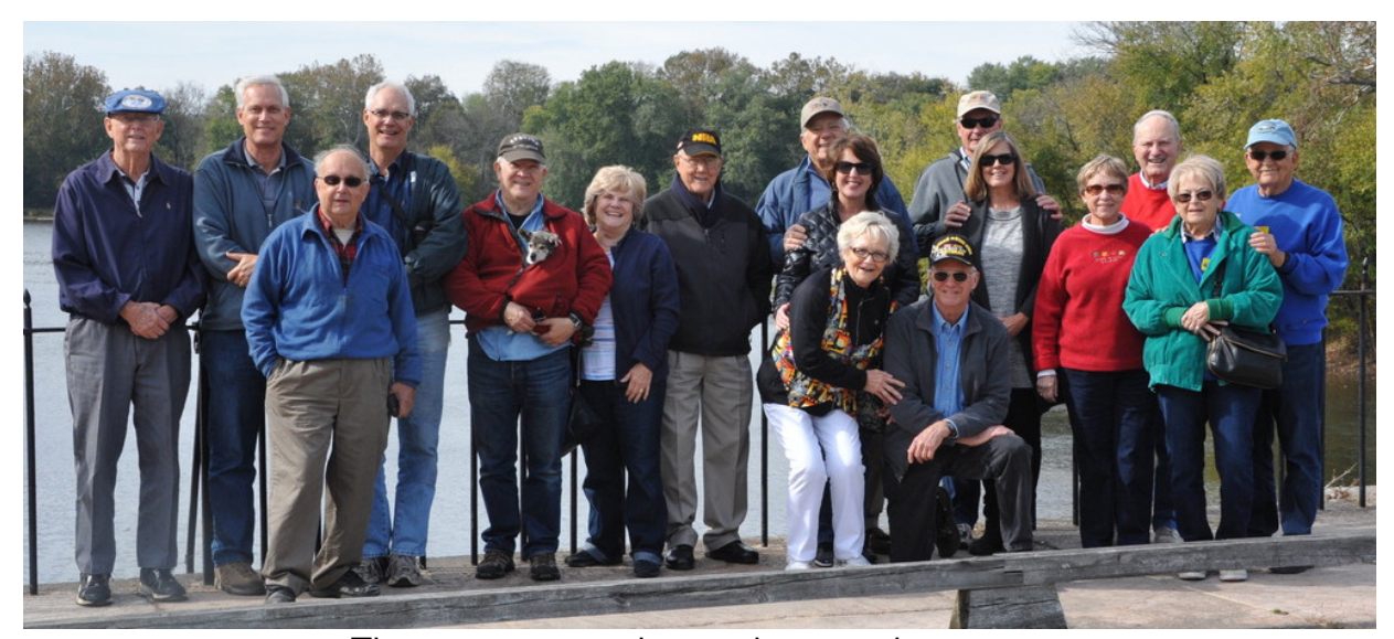
The tour gang posing on the aqueduct.