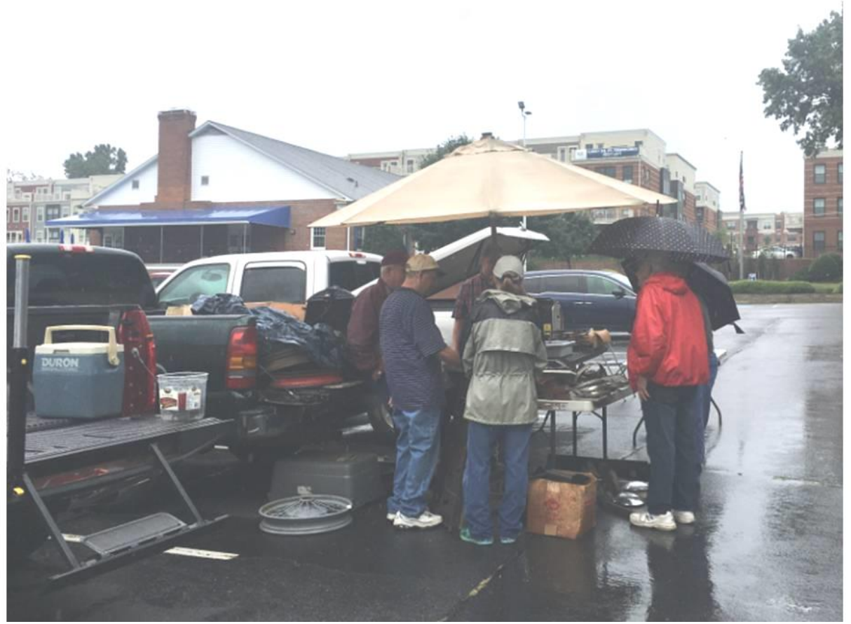
Buyers gather around one of approximately 10 sales locations

Saturday, July 21st, the day picked for the "test run" Saturday Meeting, dawned cloudy with a forecast of rain. Despite the gloomy forecast, about two dozen members came to sell and buy Model A parts and memorabilia. The event was scheduled from 10 AM to 2 PM, but the light drizzle turned into a genuine downpour, causing the event to end early. At least 10 members laid out displays of items for sale.