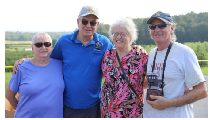
The Clements and Simses