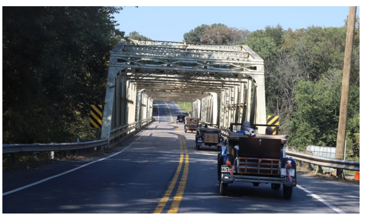
On the road to Sugarloaf Mountain after chuckin' pumpkins