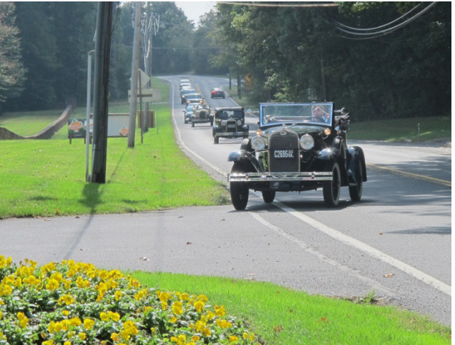
The tour arriving at Lewis Orchards for the Pumpkin Chuckin'