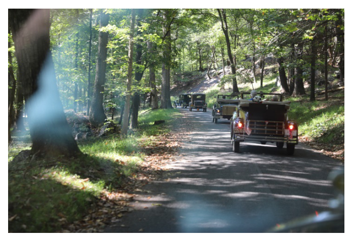
Going up the mountain