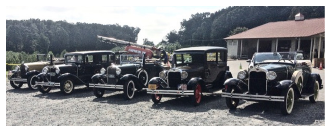
The lineup at the Pumpkin Chuckin'