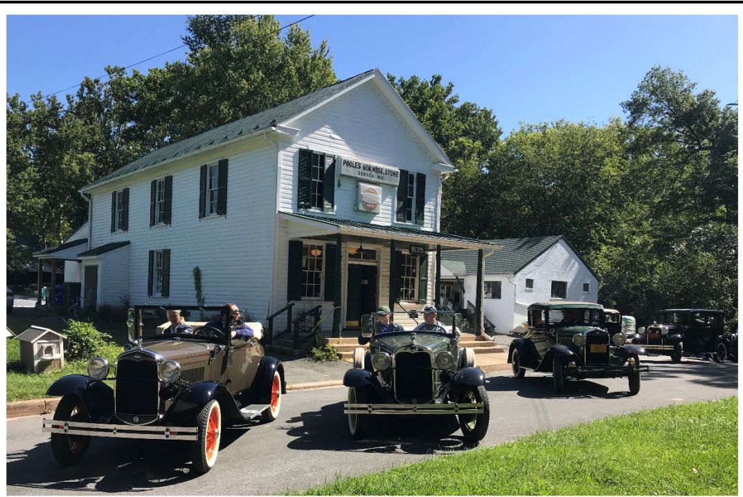
Club tour in front of Poole's General Store

<u>Vol. XLI</u> <u>October 2020</u> <u>No. 10</u>