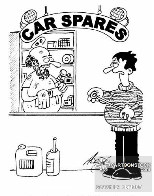
"I'm after a longer dipstick. This one doesn't reach the oil anymore."