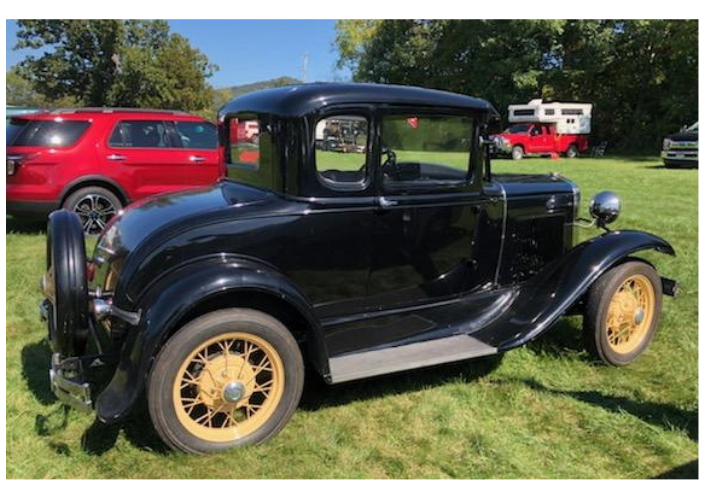
Bruce Metcalf's coupe