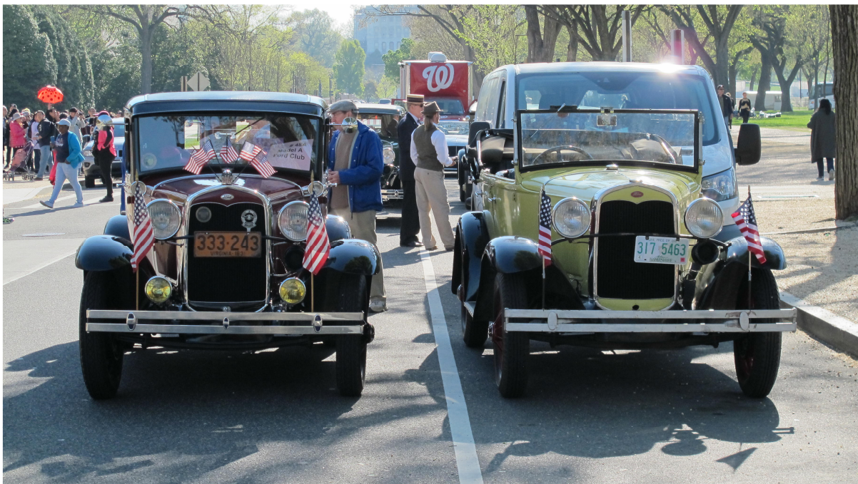
Awaiting the start of a Cherry Blossom Parade in the past