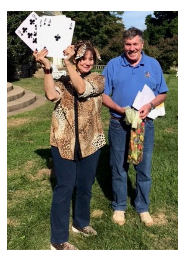
The winning hand