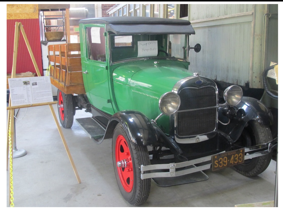
1929 Ford AA on display at the Georgetown Loop Railroad outside Denver