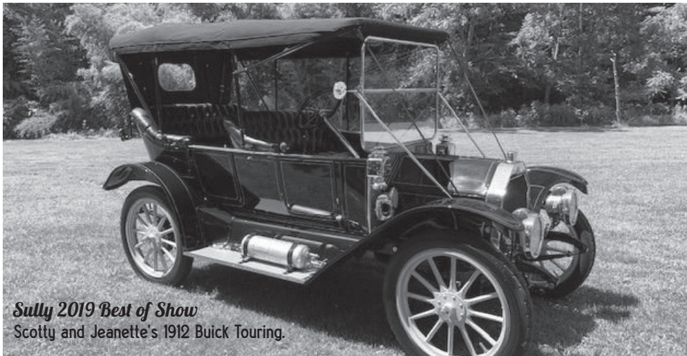
Sully 2019 Best of Show Scotty and Jeanette's 1912 Buick Touring.