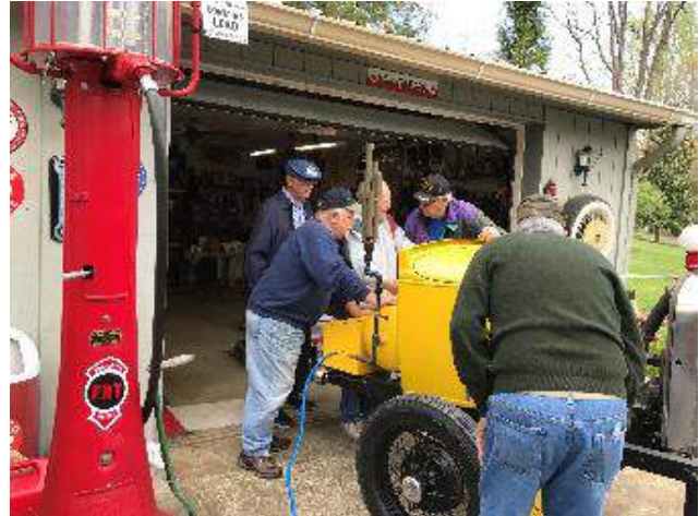
Ready to test the compressed air line for leaks.