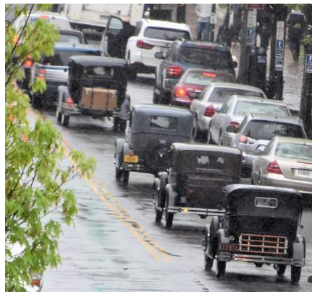
Model A's escorting Joe "home"