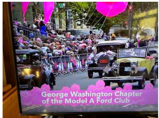
We got good air time this year, and a great cherry blossom pink banner as they showed our cars on TV.

Although a bit chilly, it was once again a fun parade.